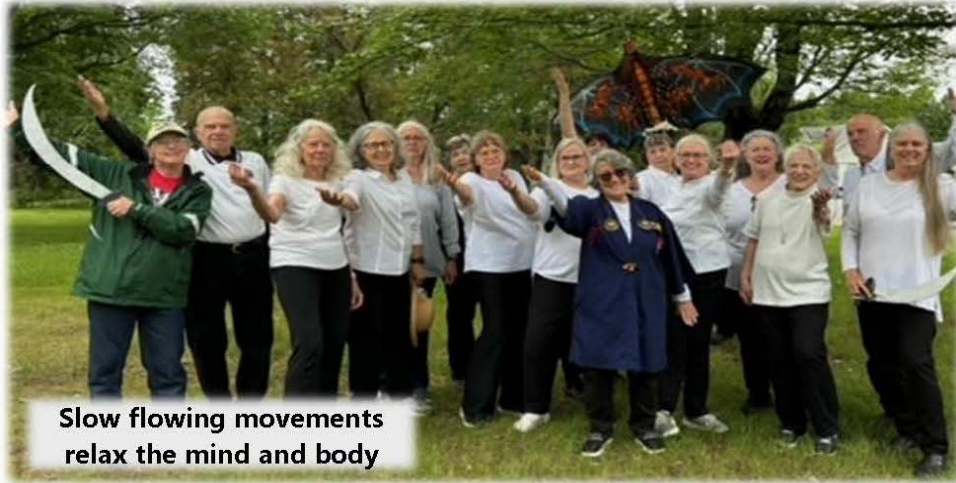
Slow flowing movements relax the mind and body