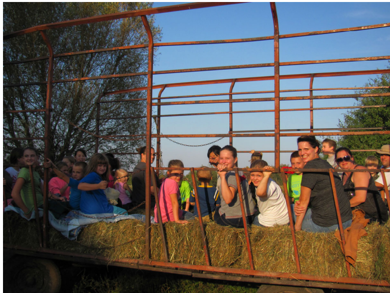
Gitche Gumees 4-H Club