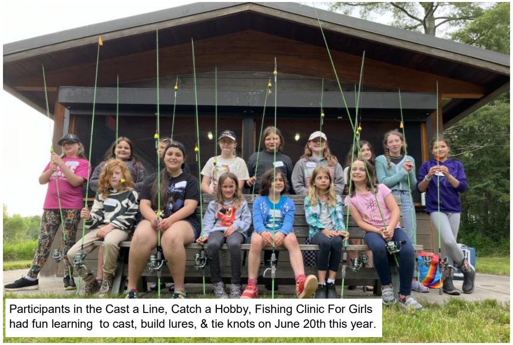
Participants in the Cast a Line, Catch a Hobby, Fishing Clinic For Girls had fun learning to cast, build lures, & tie knots on June 20th this year.