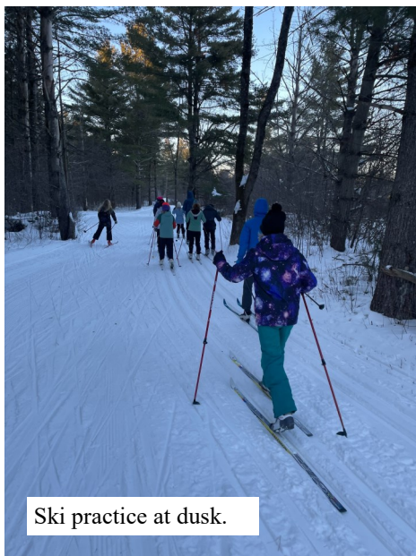
Ski practice at dusk.

Please contact Ian if you are interested in getting involved with CANSKI. Have fun while you improve your cross country or skate skiing skills this winter! All ages and abilities welcome. Instruction takes place at Mt. Ashwabay and at the Ashland Hospital trail system.