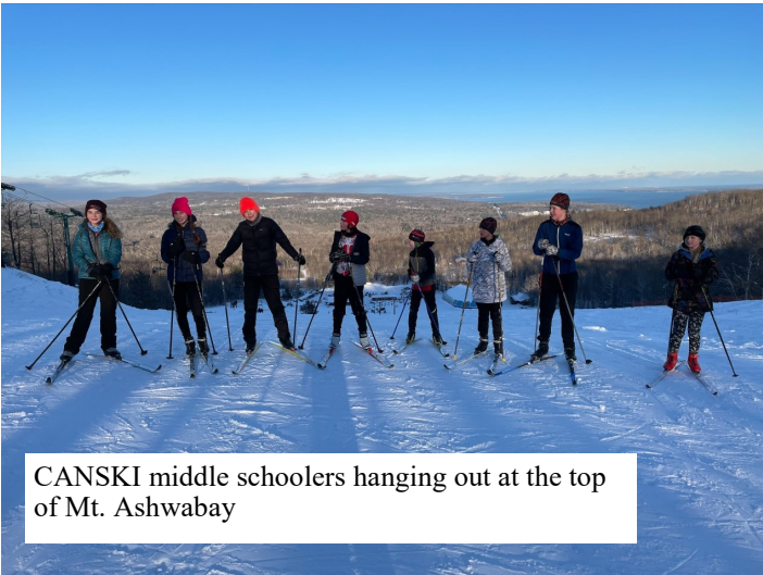
CANSKI middle schoolers hanging out at the top of Mt. Ashwabay

The CANSKI season is now in full swing! This year we have over 150 youth members between Ashland & Bayfield County!