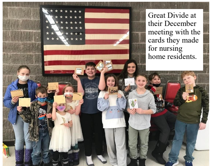
Great Divide at their December meeting with the cards they made for nursing home residents.

The Great Divide 4-H Club had a holiday party on December 12 th at noon at the Grand View Town Hall. During that gathering, we had a gift exchange, ate Little Caesar's pizza, and also made cards for the residents of a local nursing home.