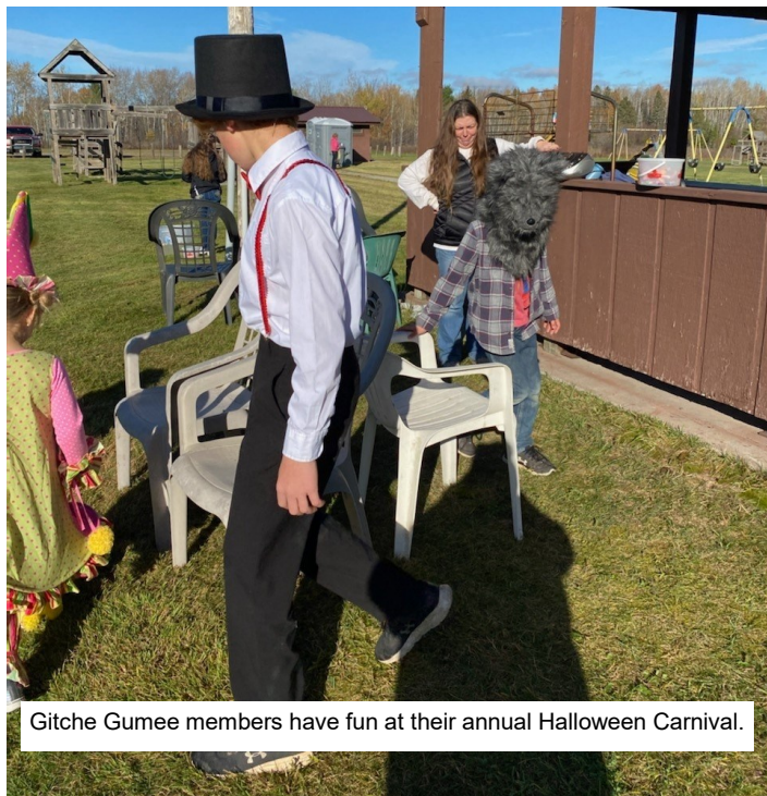
Gitche Gumees members have fun at their annual Halloween Carnival.