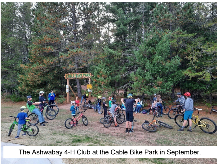
The Ashwabay 4-H Club at the Cable Bike Park in September.

The Ashwabay Bike Club has had a very successful 2021 season. After riding as a group all summer, we continued to meet on Monday afternoons after school started. We have biked on the Ashwabay Trails in Bayfield and had a well attended fall celebration down in Cable where we rode at the Cable Bike Park then went out for dinner afterwards. We will continue to ride every Monday until the snow flies.