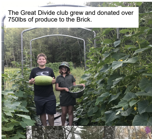
The Great Divide club grew and donated over 750lbs of produce to the Brick.