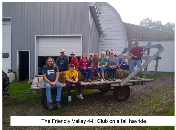
The Friendly Valley 4-H Club on a fall hayride.

Bayfield County Equine council had an organizational meeting for members and parents on 10/10 at the Iron River Community Center. Members and parents discussed what they would like to see from the group moving forward. Due to the lack of horse project leaders at some local clubs, members and parents discussed it would be helpful if the equine council leaders could act as horse project leaders, so members of those clubs are better prepared for riding at the fair. The equine council will work on a calendar, so members know when events are and the deadlines to sign up. The members showed interest in hosting clinics, developing a trail miles club/competition, practice shows, winter rides/practice at indoor arenas, field trips, horse bowl and state trips. Our next meeting will be 11/14 at the Iron River Community Center. Officer elections will be held. Pizza will be provided during the meeting.