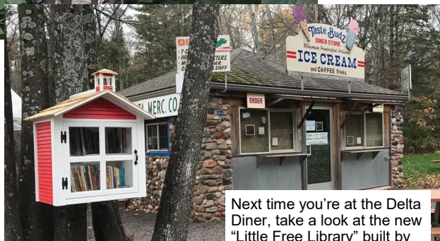
Next time you're at the Delta Diner, take a look at the new "Little Free Library" built by the Great Divide Club.