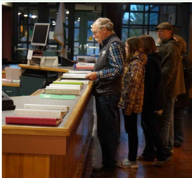
Outstanding Record Books on display at the Bayfield County 4-H Awards Banquet.