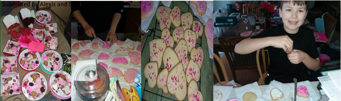
Drummond Explorers Valentines box event