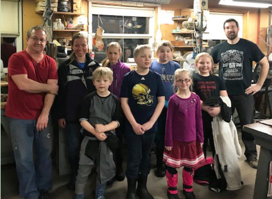
Friendly Valley's February tour of Western Engraving in Washburn

A FRIENDLY REMINDER FROM THE BAYFIELD COUNTY FAIR