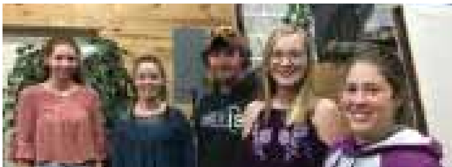
-Gitche Gumee 4-H Club Award night. ▲