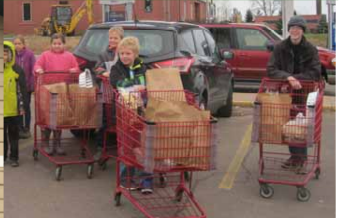
▲ Friendly Valley 4-H Club at Washburn IGA collected donations for families to enjoy a Thanksgiving dinner.