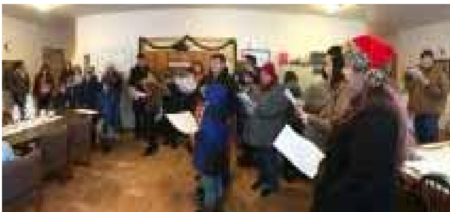
Gitche Gumee had a great turn out for caroling on Dec. 10▲