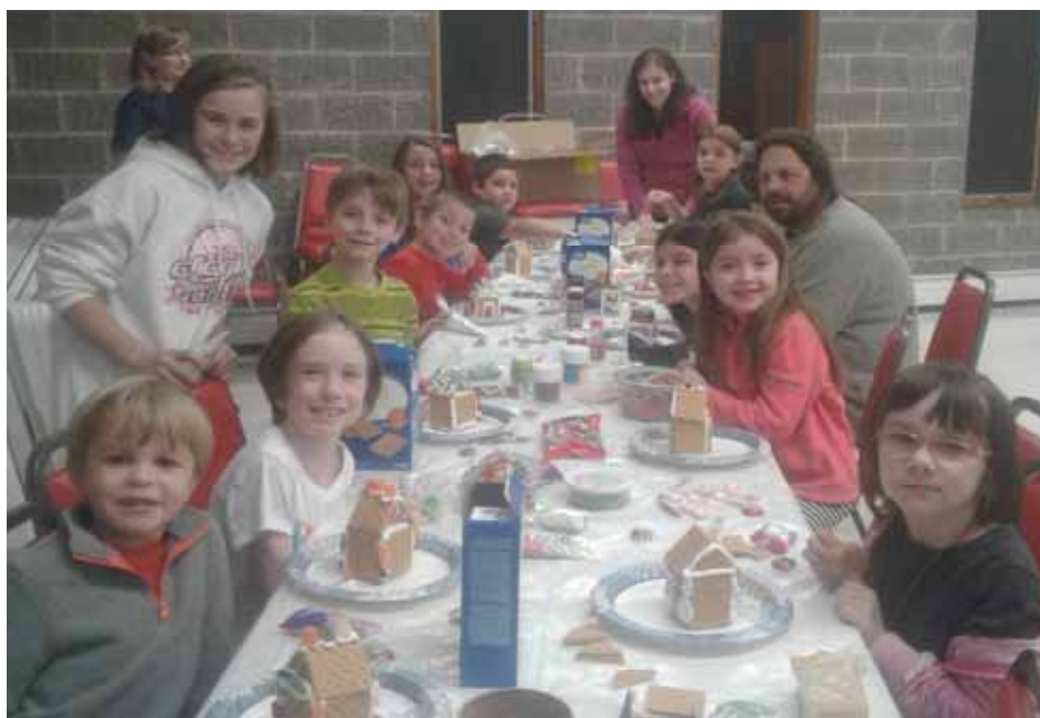
▲ Great Divide 4-H Club creating Gingerbread Houses.