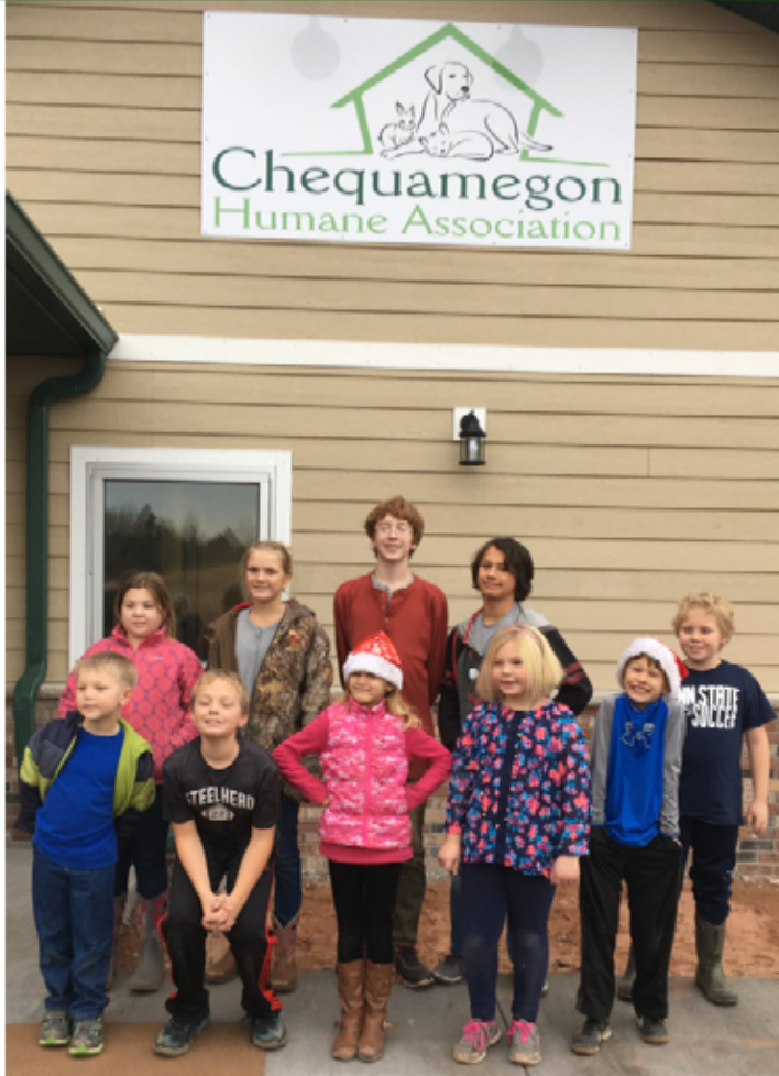
▲► Friendly Valley 4-H Club at the new Chequamegon Humane Society building.