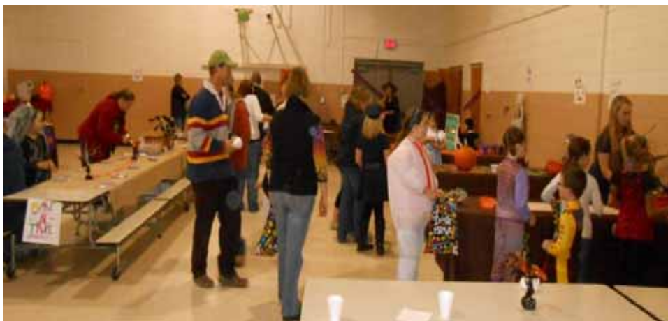
Halloween party at the Benoit Community Center—Ino Valley hosts