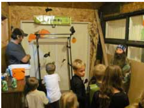
Gitche Gumee Halloween Carnival

It was a crisp yet sunny autumn day on the nineteenth of October when the Friendly Valley 4H club ventured on a bumpy hay ride at our