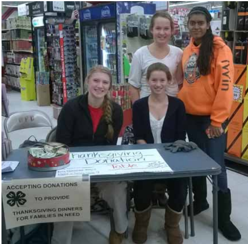
Members of the Ashwabay club recently set up a table at the Washburn IGA to request donations to purchase groceries for local families in need for their Thanksgiving dinner.