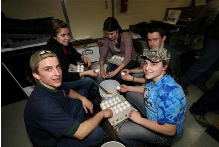
4-H & FFA members cracking eggs for the 10 huge omelets served at the Dairy Breakfast