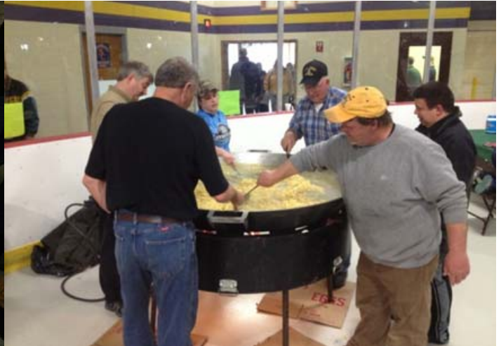
2013 cooks stirring the giant eggs, cheddar cheese, ham, onions and mushrooms omelet.