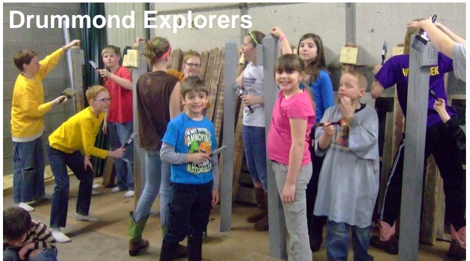
Drummond Explorers met April 22 (Earth Day) and painted signposts for the new Drummond Campground.