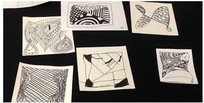
Some of the Zentangles we created.