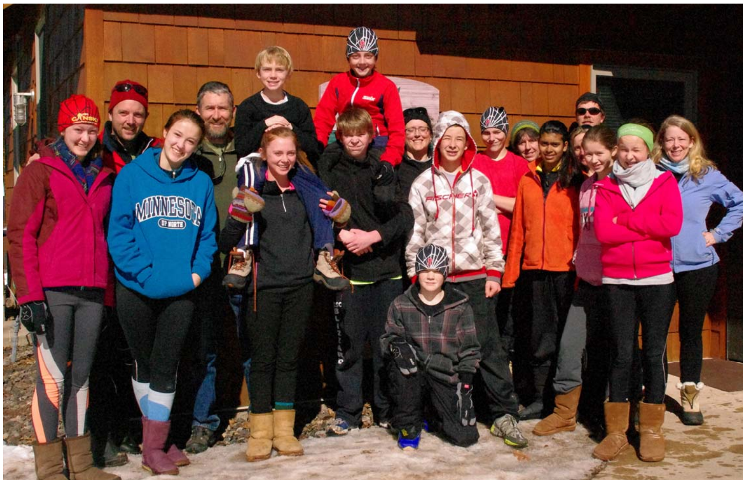
The 4-H Ashwababay club recently spent a weekend away at the Heartwood Retreat Center. Highlights included cross country skiing, ice fishing, broomball, the giant outdoor hot tub, large family style meals and enjoying each others company. Heartwood is an excellent and affordable facility for large groups willing to share space..