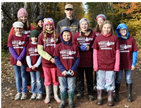
▲Pine Creek 4-H Club-Volunteering for the Whistle Stop.

Pine Creek 4-H Club members volunteered for the Whistle Stop running race.