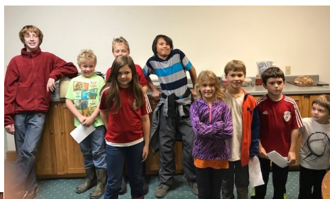
▲Friendly Valley 4-H Club members

Our clubs plans to raise money to purchase