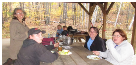
▲ Whittlesey Creek 4-H Club at Topside.

Then we did our meeting. We talked about co-hosting the Bayfield County Fall