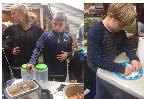
▲Hillcrest/Mt Valley 4-H members making spring rolls.