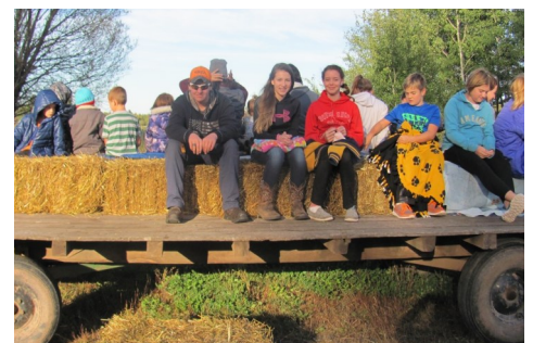
▲ Gitche Gumee 4-H Club hay