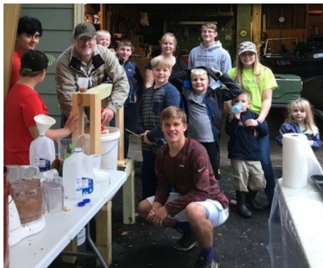
▲Hillcrest/Mt Valley 4-H Club members making apple cider.

We enjoyed a great fall day having a picnic, picking apples and making cider.. We also got to try our hand at making egg rolls and eating them too!