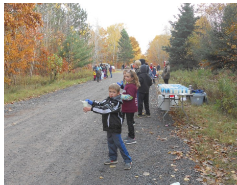
▲Ino Valley 4-H Club-Volunteering for the Whistle Stop.

Ino Valley started the year with our annual Whistle Stop water/snack station. We set up at 8:00 Saturday morning, on the Corridor, and saw the first runners around 9:30/10:00. A good amount of runners came by, grabbed water and juice from our younger members. They were so thrilled when their offer of water or snacks were taken. Just the big smile on their faces was worth having the station. We wrapped up at 11:30. It was a cool day but perfect for the runners.