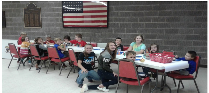
▲ The inaugural Great Divide 4-H Club meeting held at the Grand View Town Hall.