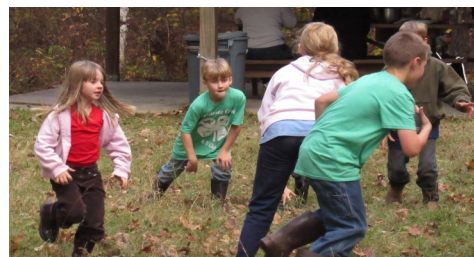
▲ Whittlesey Creek 4-H Club members playing after their meeting at Topside.

Our club is also in the top five out of 75 entries in the WI 4-H Cedar Crest Ice Cream flavor contest. Our entry is called "Superior Shores". It is made with Cedar Crest vanilla ice cream, chocolate rocks, raspberry and blueberry swirls. It represents our area of Wisconsin.