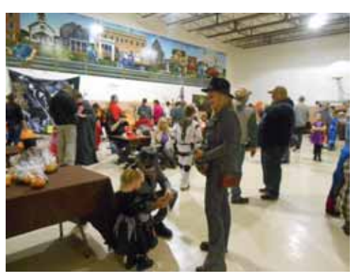
Community Halloween Party put on by Ino Valley at the Benoit Community Center Oct. 29