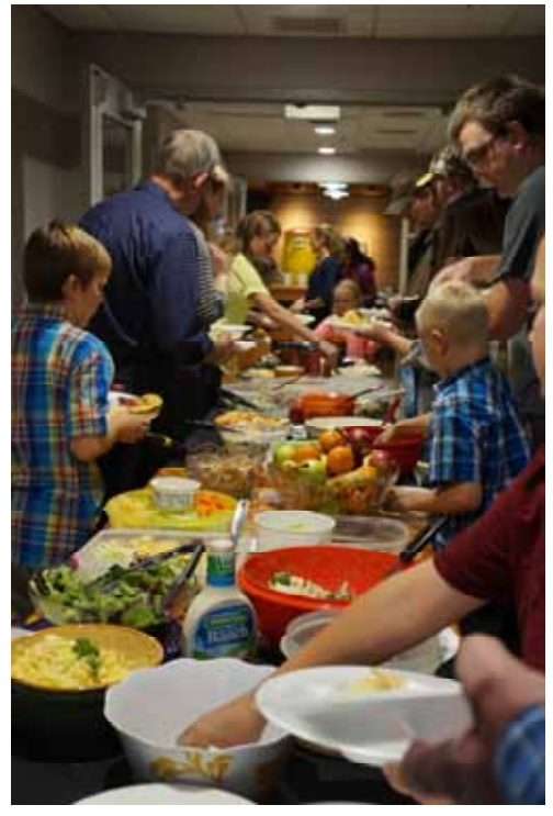
A delicious, plentiful, and colorful potluck meal was enjoyed by all