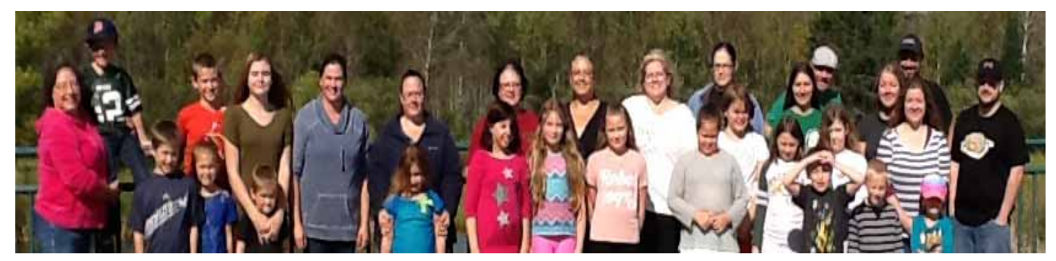
Ino Valley 4-H Club members, leaders and parents at the enrollment meeting held at the Great Lakes Visitor Center.