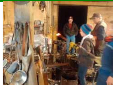
Friendly Valley 4-H Club members on a blacksmithing adventure. ▲▼