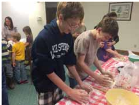
Friendly Valley 4-H Club members making bread ▼ ▶