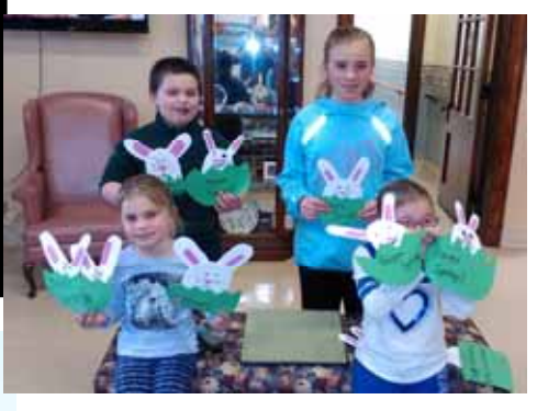
New members from Woodland Workers visited the Ashland Health Care facility and handed out these decorations for residents' rooms.