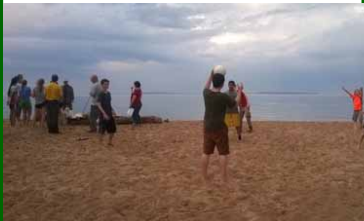
Ashwabay Beach Clean-up activity.