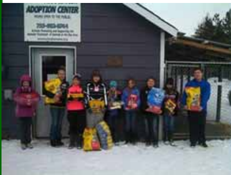
Whispering Pines 4H members made a much appreciated visit to the Chequamegon Humane Society.

Next meeting will be the roadside clean up on April 19.