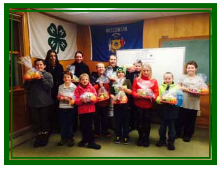
At the Woodland Workers January meeting the group put together fruit baskets to give to someone in need or elderly. They made 12 all together.

New Business: What winter activity what would you like to do? After discussion it was decided to go sledding at Mt. Vahalla on Saturday February 21st, 2015