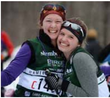
4-H GROWS Character