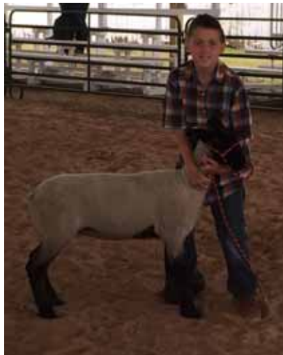
4-H GROWS Caring