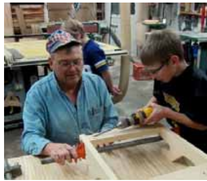
4-H GROWS Confidence