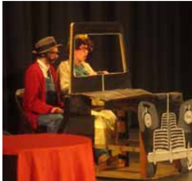
4-H GROWS Communication