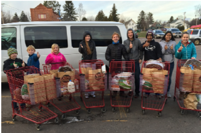
4-H GROWS Community Contribution