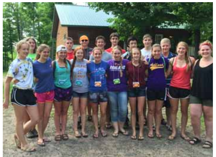
4-H GROWS Positive Youth