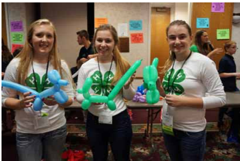
4-H GROWS Positive Youth