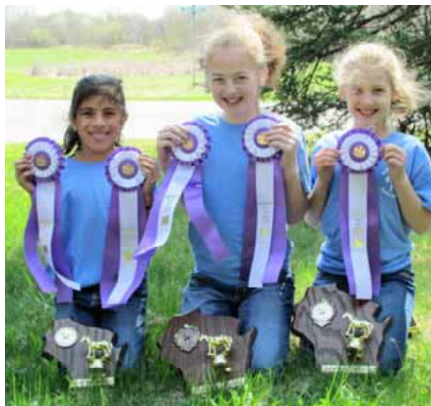
4-H GROWS Competence