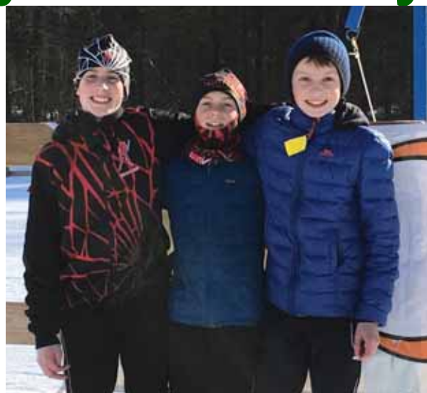
4-H GROWS Character