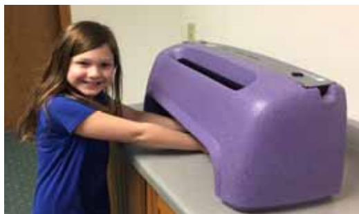
Friendly Valley 4-H Club—the January meeting started out with an introduction to hand washing followed by learning how to make finger puppets out of felt