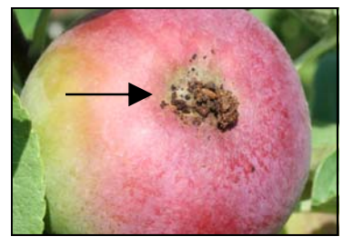
▲ Photo 3. Often the only sign an apple is infested with codling moth larvae is a small hole with frass, usually at the calyx end of the apple.